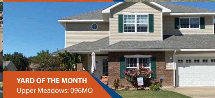
YARD OF THE MONTH Upper Meadows: 096MO