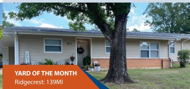
YARD OF THE MONTH Ridgecrest: 139MI