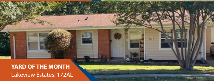
YARD OF THE MONTH Lakeview Estates: 172AL