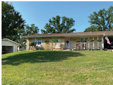
Lakeview Estates: 173AL