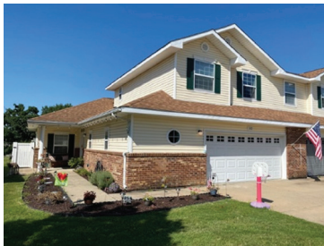
Upper Meadows: 132MS