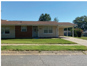
Lower Meadows: 112TN